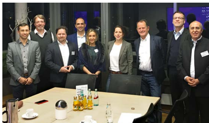
SOLARUNITED Board and Management