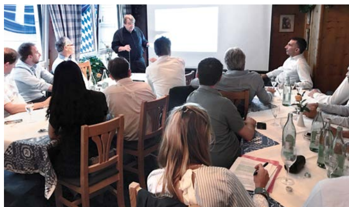
SOLARUNITED Meeting in Munich during Intersolar Europe 2019